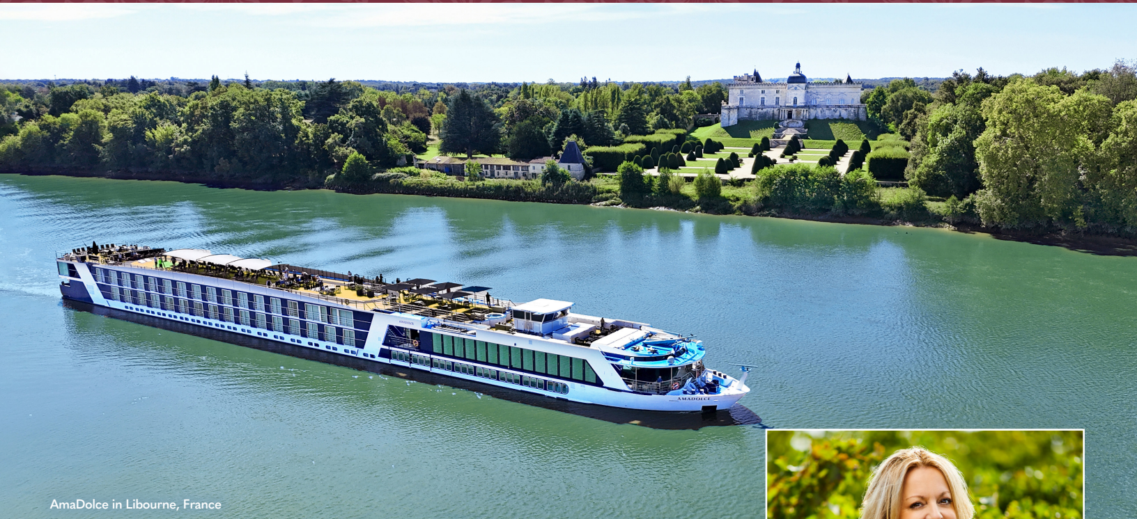
AmaDolce in Libourne, France

UNCORK LOCAL TRADITIONS, SAVOR INTENSE FLAVORS AND ENJOY PALATE-PLEASING ADVENTURES DURING AN AMAWATERWAYS WINE CRUISE